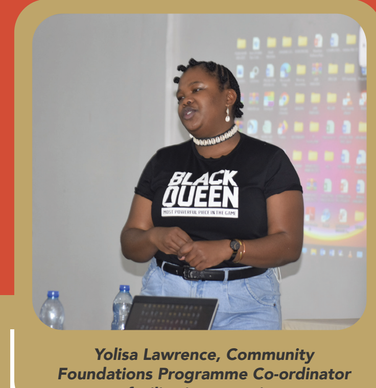
facilitating a session