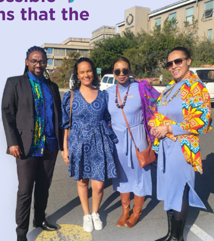
ICA staff attended Africa Day celebrations hosted by CAPSI

The excitement for ICA's future is Huge! Inspired by the dedication of our donors and stakeholders, we envision a future where the ripple effect of our collective efforts will reach even greater heights. Our work is far from over, and with the support of our community, partners, and the wider public, we are ready to face the challenges ahead with determination and compassion.